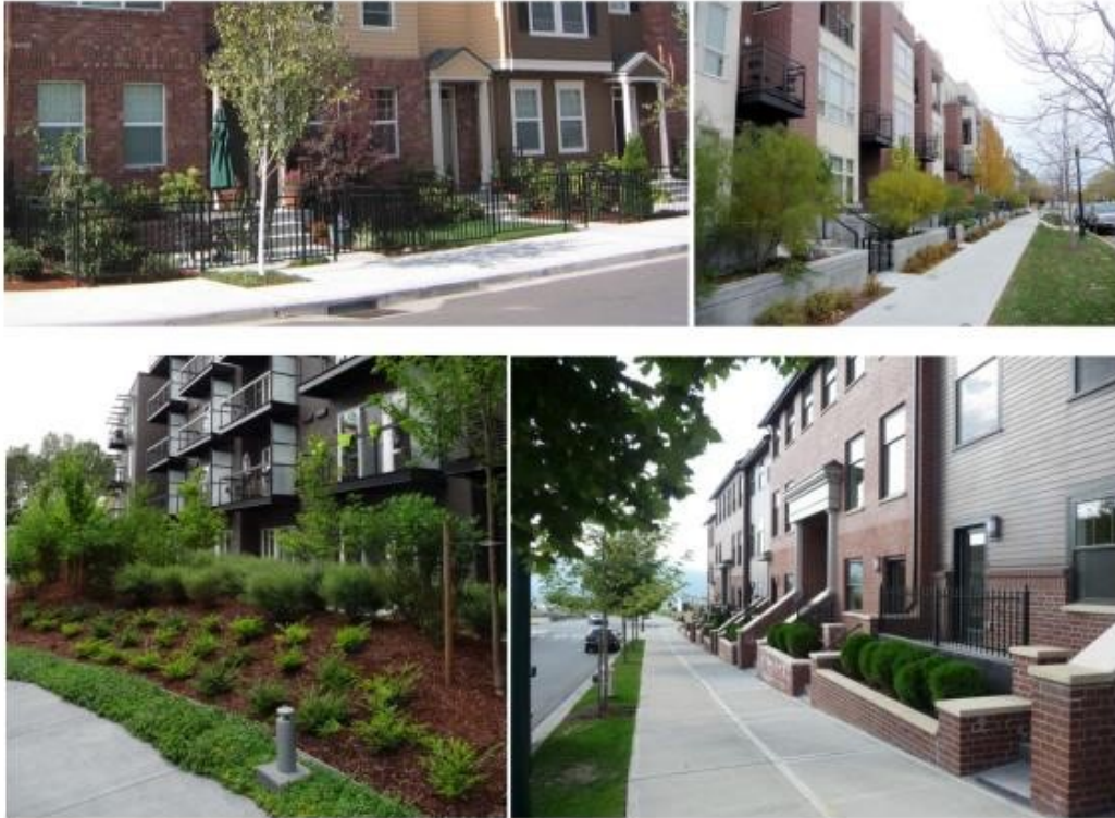
Figure 8 -Acceptable Public/Private Transitional Space Design between Through-Block Connections and Ground Level Residential Units

Which design will the proposed building look like above? From what I have seen, it looks like there is a massive cement wall in front of the building.