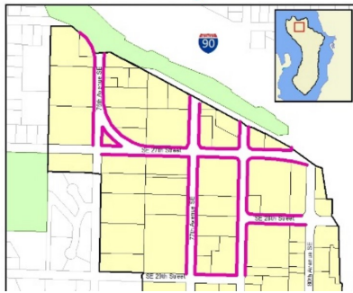
Figure 2— Area of Required Retail, Restaurant or Personal Services Use Along Ground Floor Street Frontages

"Setbacks. a. 78th Avenue SE. All structures shall be set back so that space is provided for at least 15 feet of sidewalk between the structure and the face of the street curb, excluding locations where the curblines are interrupted by parking pockets. Additional setbacks are encouraged to provide space for more pedestrian-oriented activities and to accommodate street trees and parking pockets"